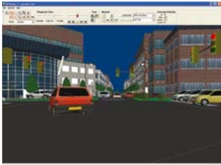
↑ Trafficware's 3D Viewer 7 allows you to create 3D scenes directly from SimTraffic, creating realistic views of traffic environments