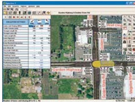
↑ Synchro 7 adds a list of new features such as the ability to visualize full geometric layouts within the software package

models don't have that kind of capability, especially at a regional scale. So, we're looking at every facility, every intersection, every junction across the region, and all the people traveling within it have their assigned destinations that they're trying to reach, either maximizing utility or minimizing the cost of getting to that location. And it's taking place dynamically, so the agents in the model are changing their behavior based on the network conditions."