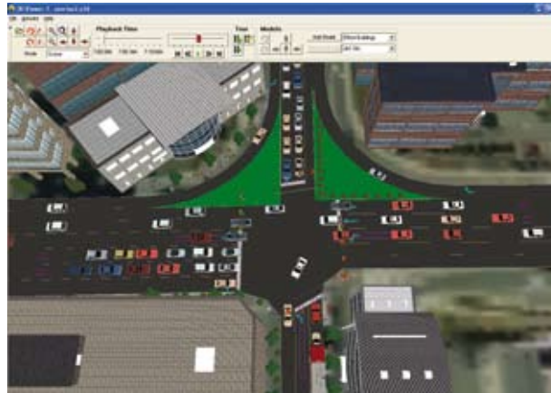
SimTraffic simulates signalized intersections, unsignalized intersections (including roundabouts) and the interaction that occurs